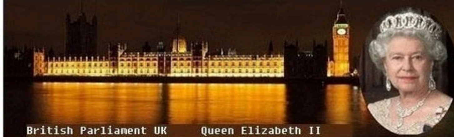
British Parliament UK