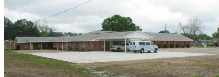
New Parking Facility