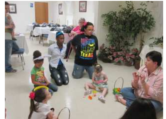
Preschool & Children's Easter Celebration Saturday, March 30, 2013

Thank you for your prayers and generous offerings for the North American Missions causes. Total received for 2013: $2,310.00