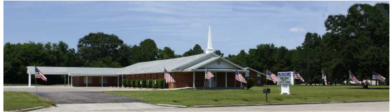
Celebrating the 4th at WEBC

West End Baptist Church Vol. 2013 No. 7 July 1, 2013