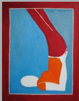
"SARVANGASANA" 16" x 20" OIL ON CANVAS