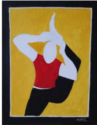
"EKA PADA SIRASANA" 16" x 20" OIL ON CANVAS

These paintings capture the artist's personal experience with "Kriya Yoga" a system of yoga that brings calmness and control to both body and mind. The colorful renditions represent her playful involvement with yoga, and the white spaces indicate her spiritual calmness.