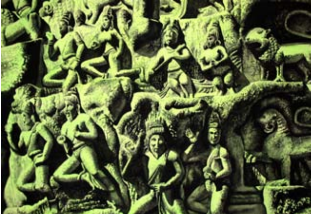
UNTITLED 1 30" x 22" WATERCOLOR

The interplay of light and texture in the cave temple sculptures of Mahabalipuram, India, inspired this collection. Fluorescent washes of color with shades of black have been used to bring out the intricate details. The pieces in this collection are untitled to maintain the original meaning represented by the sculptures.