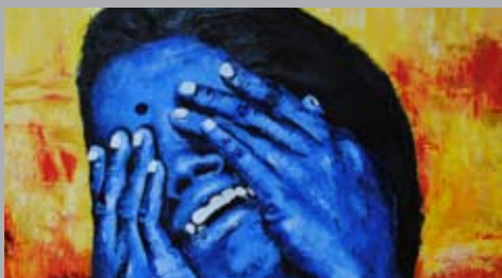
"TEARFUL TRIBULATIONS" 36" x 24" OIL ON CANVAS