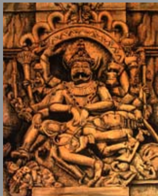
"UNTITLED 6" 22" x 30" WATERCOLOR