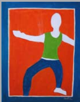
"VIRABHADRASANA" 16" x 20" OIL ON CANVAS