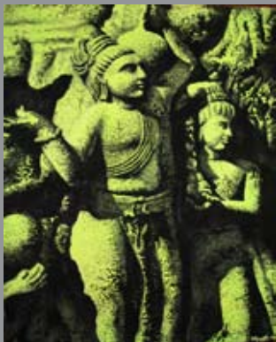
"UNTITLED 2" 15" x 22" WATERCOLOR