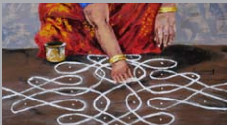
"MORNING CREATIONS" 36" x 24" OIL ON CANVAS