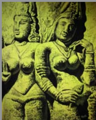
"UNTITLED 4" 22" x 30" WATERCOLOR