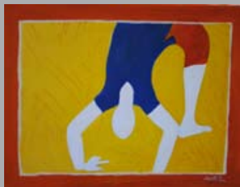
"DHANURASANA" 20" x 16" OIL ON CANVAS