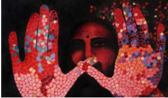
"AMBIGUOUS SOVEREIGNTY" 40" x 30" OIL ON CANVAS

“Kriya” is a collection of paintings that depict the expressions of women in india. In Sanskrit, the word means “action,” “deed”, “effort.” The rich panoply of colors seen in the apparel of indian women, in their henna embellishments and simple decorations outside their homes, accentuates their simple actions. The colors and impetuous strokes shows the artist’s admiration for women who use vibrant colors to elevate their spirits and their mundane surroundings.