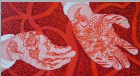
"FLEETING ECSTASY" 40" x 30" OIL & ACRYLIC ON CANVAS