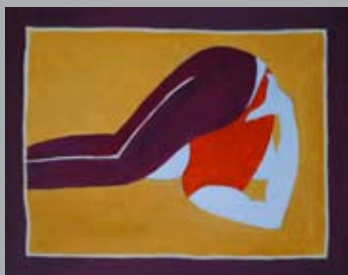
"HALASANA" 20" x 16" OIL ON CANVAS