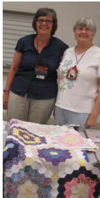
English paper piecing evening class