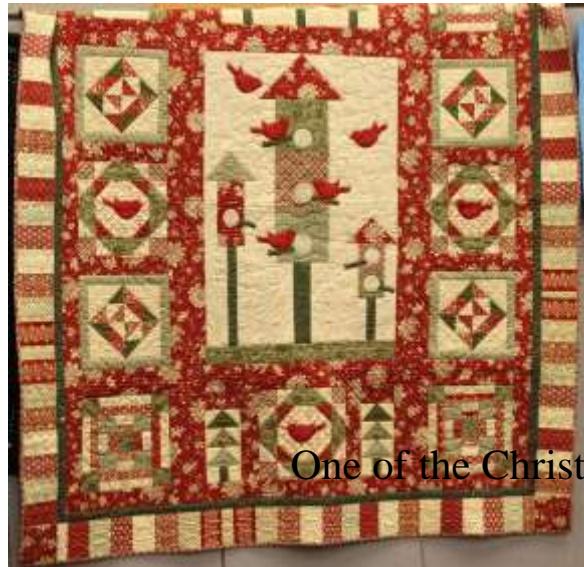
One of the Christmas quilts