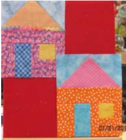
Block for August Beach Cottage

Block of the Month: 18 plus blocks were won by Dorothy Moyle Smith, any question about next month's block call Linda.