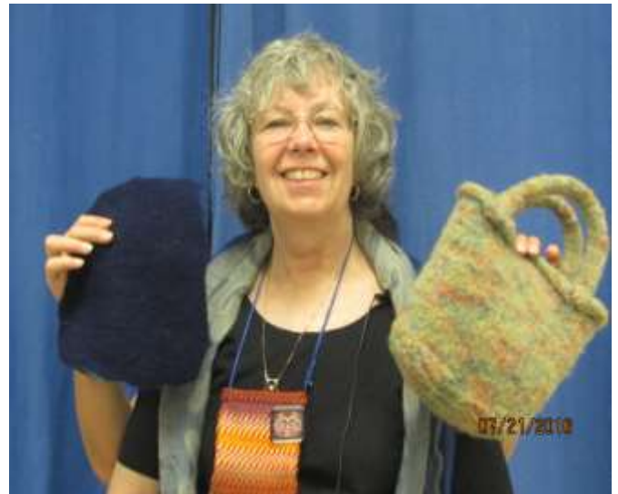
Our Speaker at guild Meeting about fiber fusion