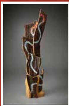
Water's Pathway by Aaron Laux