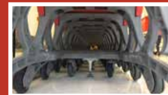
Mutual Measurement by Xiaoqing Zhu

Xiaoqing Zhu is a multidisciplinary artist, born in Beijing China, and currently based in Chicago, IL. Through video, installation, performance, photography and printmaking, Xiaoqing's creations challenge the expected functionality of objects and the human body, and explores the intersection between human activity and city environment. Mutual Measurement is the result of the one month documentation of her impromptu performances responding to Chicago's local environment by fitting her body into industrial products.