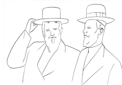
This is because not all khsidim are altogether alike.