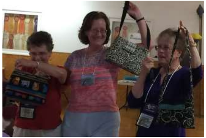
Hand Bags from recent workshop