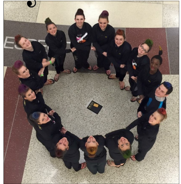
The team is all smiles after a 1st-place performance at Plainfield High School.