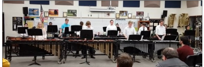
The Group I percussion ensemble performs before the judge.