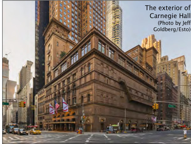
The exterior of Carnegie Hall

Hotel to verify some of the amenities. You can bring electronics, because Internet connectivity is included in the price. (Connectivity is also available on the buses, but because broadband is spread out over all online passengers, it is limited.)