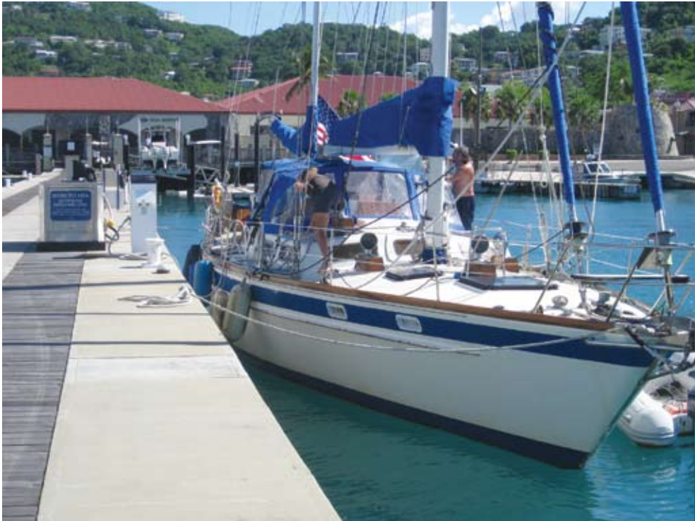
Left, taking on water in Charlotte Amalie. Opposite, entrance to Cruz Bay, St John