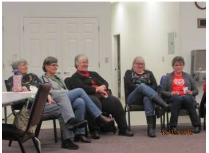
Smiles by everyone, sorry day group, my camera seem to be facing the wrong way, I got the back of everyone's head.