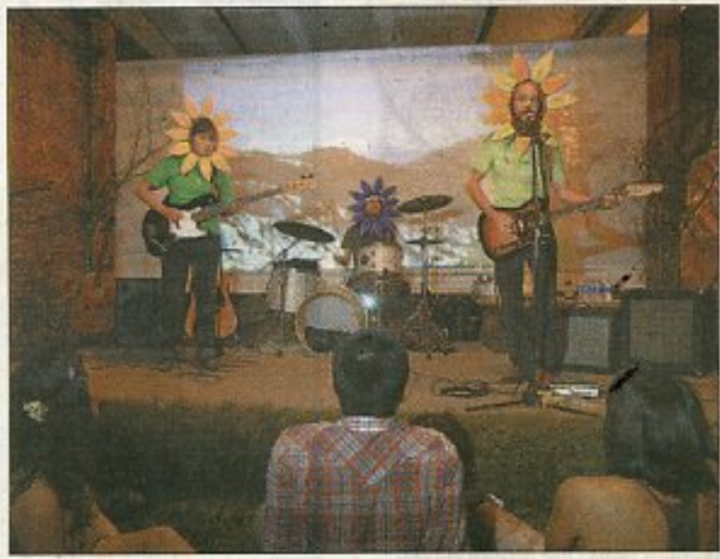
▲ Dash-Dash played some Roots covers. Okay, not really.

Want to see more? Check out the extended photo gallery at www.velocityweekly.com .