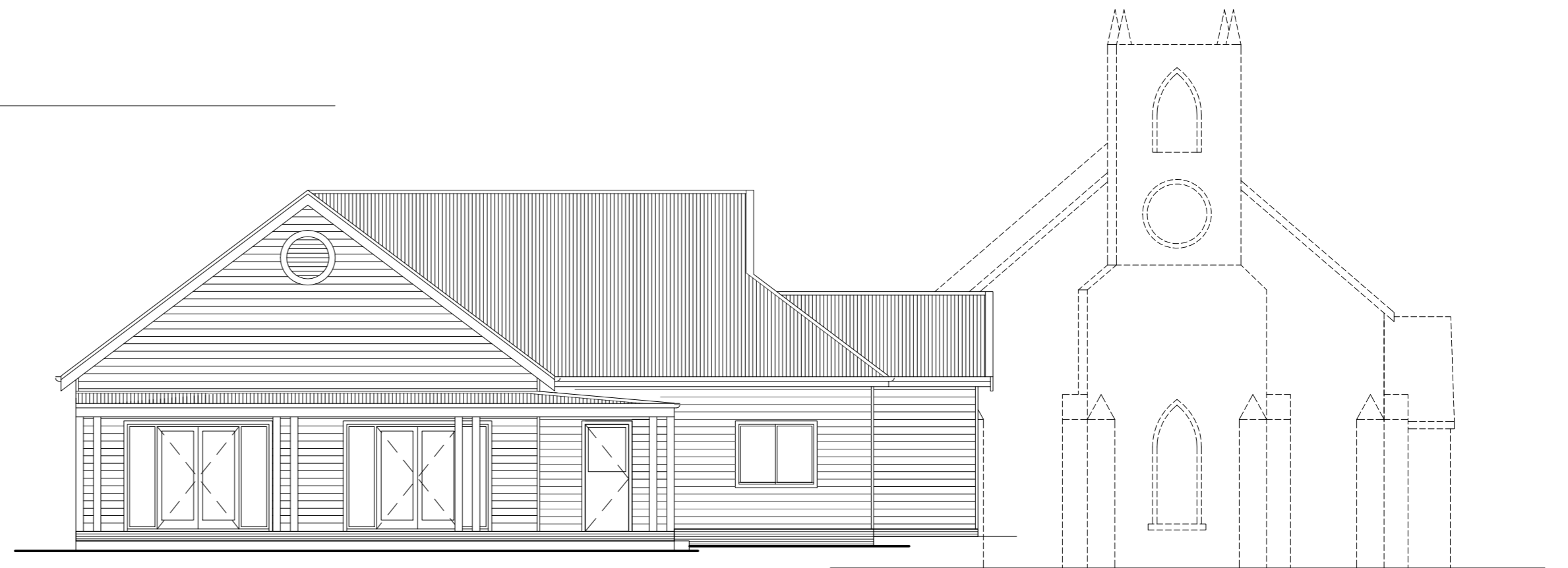
3 NORTH WEST ELEVATION 1 : 100