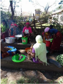
Women cooking lunch during campaign

2017 is going by quickly. Time does move fast. We hope that everyone is ready for this last month of festivities and prepared to bring in a new year.