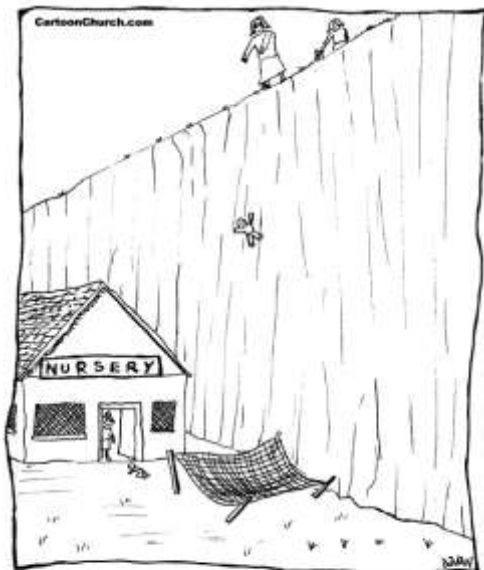
The Parents came to drop their children off at the nursery.